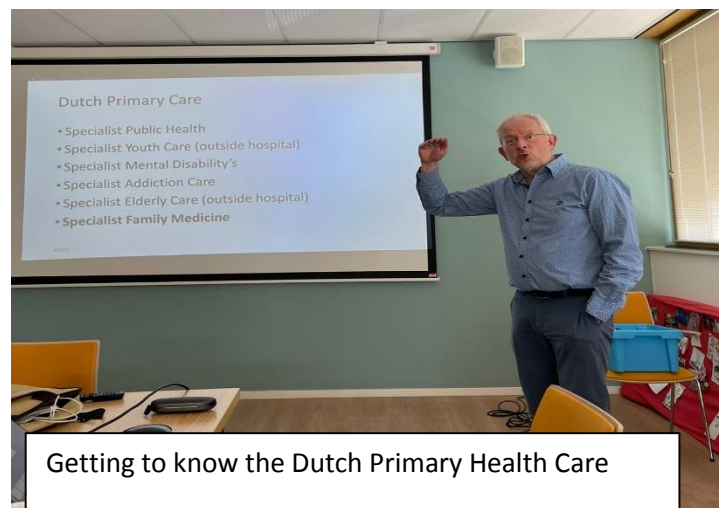
Getting to know the Dutch Primary Health Care