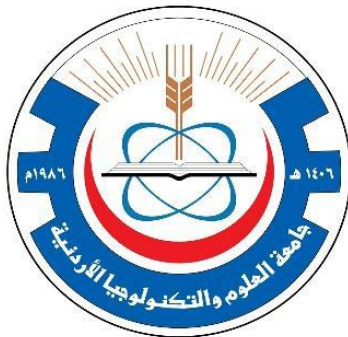
Jordan University of Science and Technology