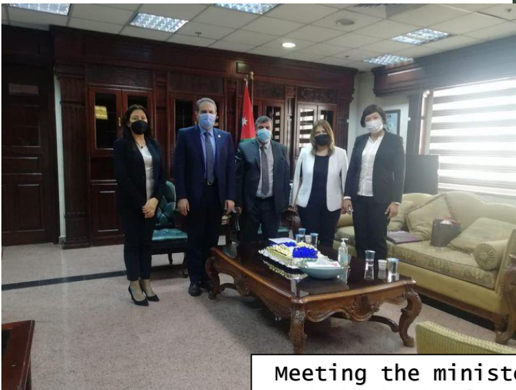
Meeting the minister of health, and the head of Family Medicine training at the MOH