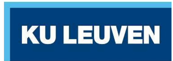
Katholieke University Leuven