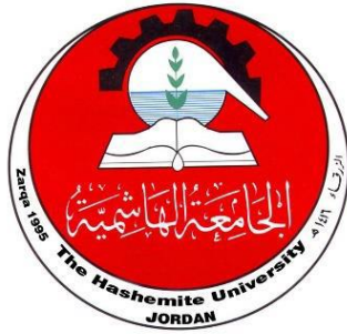
The Hashemite University