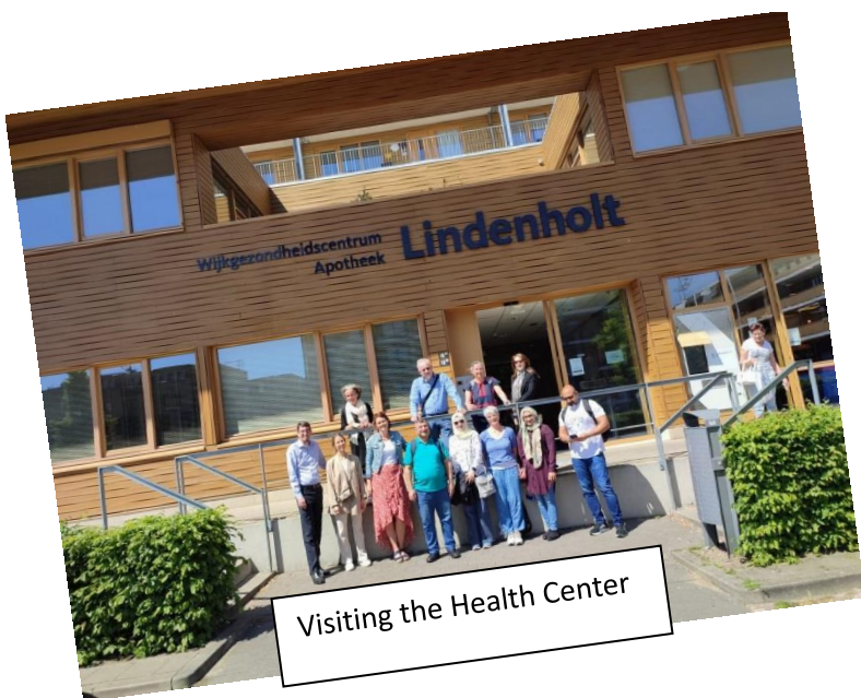
Visiting the Health Center

Another tour of a Family Health Center was concluded by a presentation on the organization of healthcare in the Netherlands, specifically as it pertained to the Family Health sector.