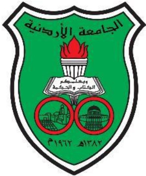
University of Jordan